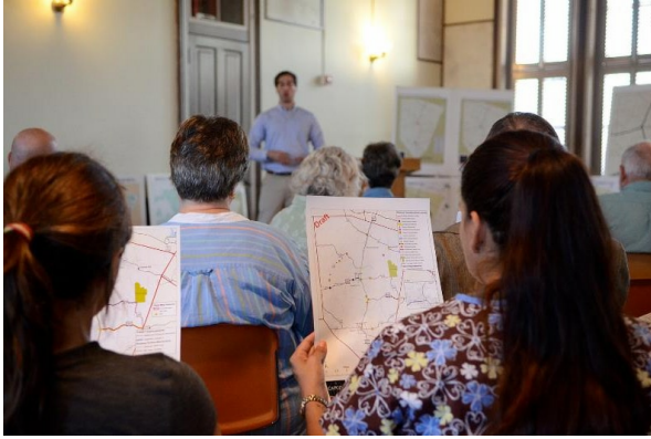
Metropolitan planning organizations: What they do, how they work in Texas