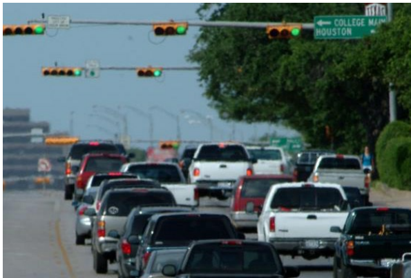
What's the right mix of congestion mitigation strategies for a given city?