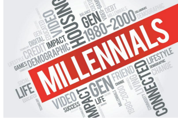
How will millennials impact freight flows in Texas?