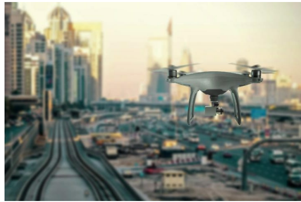
Do unmanned aircraft systems have a place in traffic incident management?